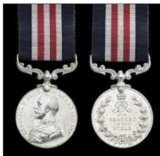
Military Medal (MM)

The Military Medal (MM) was a military decoration awarded to personnel of the British Army and other arms of the armed forces, and to personnel of other Commonwealth countries, below commissioned rank, for bravery in battle on land. The award was established in 1916, with retrospective application to 1914, and was awarded to other ranks for "acts of gallantry and devotion to duty under fire". ( Wikipedia )