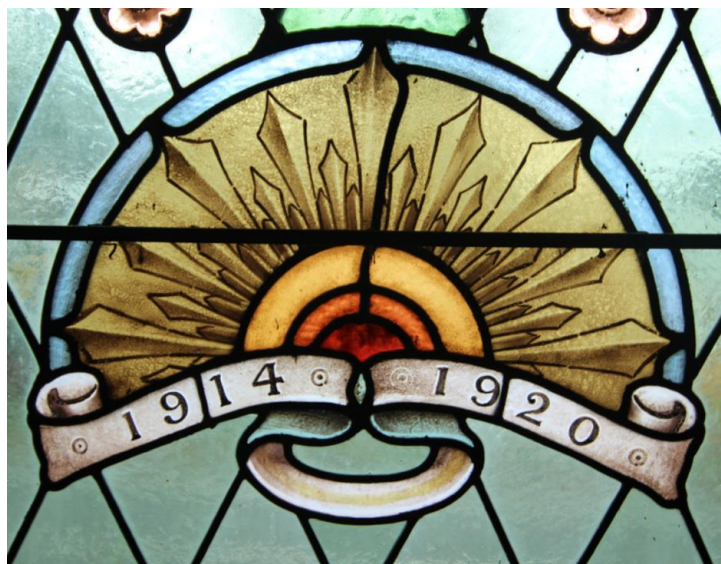
A portion of Stained Glass Windows in Barkly Street Uniting Church, Ballarat East, Victoria