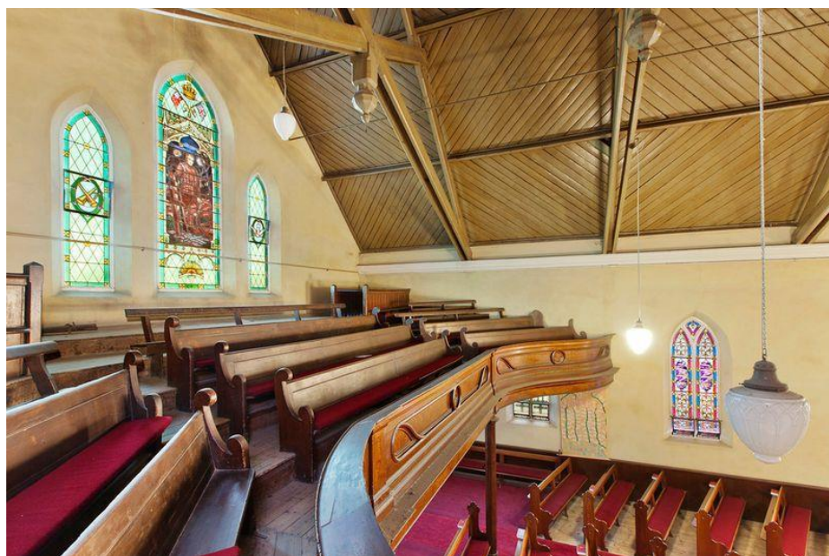
Stained Glass Windows in Barkly Street Uniting Church, Ballarat East, Victoria