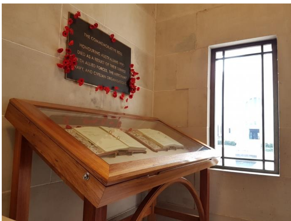
Commemorative Roll Book at The Australian War Memorial