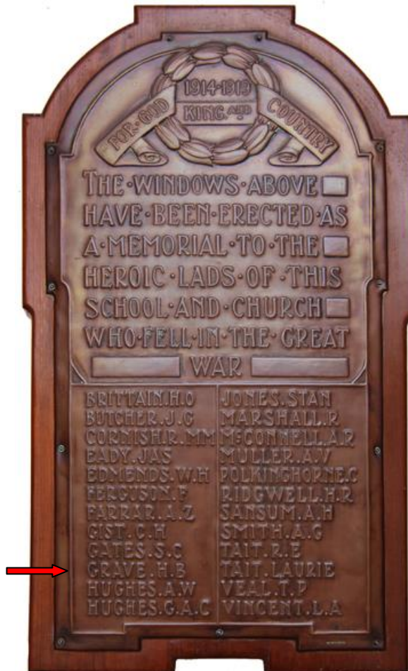
Plaque below Stained Glass Windows in Barkly Street Uniting Church, Ballarat East, Victoria